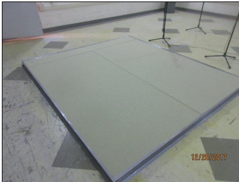
Photo No. 1 Receive Room View of Installed Test Specimen