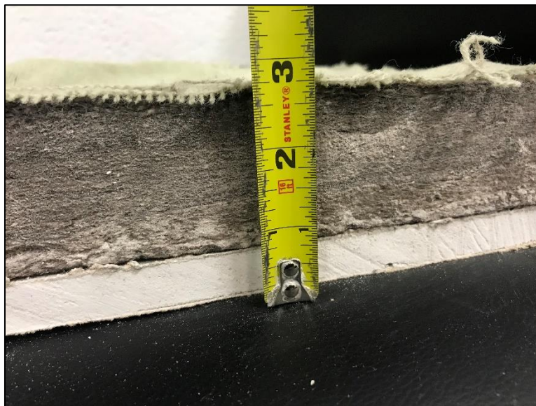
Photo No. 2 Cross Section View of Test Specimen